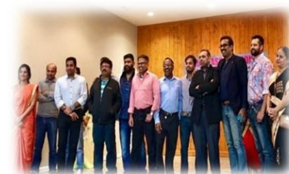
KAN Executive Committee

ഡിസംബർ 8, 2017യിൽ നടന്ന വാർഷിക ജനറൽബോഡി മീറ്റിംഗിൽ വച്ച് കാണിന്റെ പുതിയ ഭാരവാഹികളെ തെരഞ്ഞെടുത്തു.