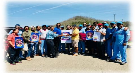
Madhuram 18 ticket sales launch

നാഷ്വിലിലെ മലയാളികൾക്ക് വേണ്ടി കാൻ കൊണ്ടുവരുന്ന ഈ പരുപാടി പ്രശസ്ത സിനിമാനടൻ ബിജുമേനോന്റെ നേതൃത്വത്തിലും, സംവിധായകൻ ഷാഫിയുടെ മേൽനോട്ടത്തിലും ഒരുക്കുന്ന ഒരു മനോഹരമായ കലാവിരുന്നാണ്. ഈ പരുപാടിയിൽ പങ്കുകൊണ്ടു ഇതൊരു വിജയമാക്കി, ഇത് പോലെ ഒരായിരം പരിപാടി നാഷ്വിലിന്റെ മണ്ണിലേക്ക് കൊണ്ട് വരാൻ കാനിന് എല്ലാ പ്രചോദനവും നൽകുവാൻ നമ്മൾക്കൊരുമിത്തർക്കും കഴിയട്ടെ എന്ന് പ്രത്യാശിച്ചു കൊണ്ട് ഞാൻ നിർത്തട്ടെ.