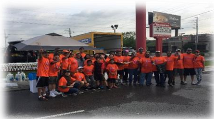
Marathon Volunteering 2017

കേരളത്തെയാകെ ഉലച്ച ഒരു സംഭവമാണല്ലോ ഓഖി ദുരന്തം. പ്രബുദ്ധരായ നാഷ്വിലിലെ മലയാളി സമൂഹം ഈ ദുരിതത്തെ തെട്ടലോടെയാണ് കേട്ടതും കണ്ടതും. അതുകൊണ്ടു തന്നെ തങ്ങളാലാവുന്ന വിധം ദുരിതാശ്വാസത്തിലേക്കു സംഭാവന ചെയ്യാൻ സന്നദ്ധരായി മുന്നോട്ടു വരികയും, കാനിന്റെ നേതൃത്വത്തിൽ $2500.00 സമാഹരിച്ചു.