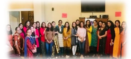
KAN Womens forum

മാർച്ച് 18-ന് കാൻ വനിതകൾ ഒത്തൊരുമിച്ചതാണ് ഈ വർഷത്തെ മറ്റൊരു പ്രത്യേകത. കാണിന്റെ ചരിത്രത്തിൽ ആദ്യമായി സംഘടിപ്പിച്ച ഈ ഒത്തുകൂടൽ നമ്മുടെ സ്ത്രീജനങ്ങൾക്കു കുറച്ചു നേരം എല്ലാമറന്ന തങ്ങളുടേതായ ലോകത്തു